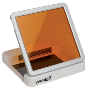
730-1390 Transilluminator Blue Slim 10x12 cm, 470 nm