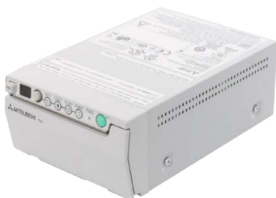
730-1260 Thermal printer, digital