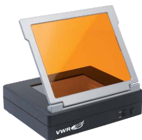
730-1389 Transilluminator Blue, 20x16 cm, 470 nm