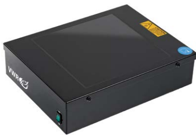
730-1461 Transilluminator 20x20 cm, 302 nm